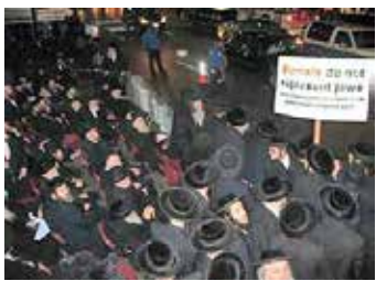
"Zionists do not represent all Jews."

A moral reason is added to the religious reason of obedience to the divine will (which forbids the Jews from founding a secular state). Human beings have a sacred duty to obey the Ten Commandments, and Jews are no exception to the rule. The Commandments order to respect the life of others, the reputation of others, the goods of others. Jews loyal to the Torah strive to uphold these principles, and they urge their Jewish brethren to do the same. They express their regret by saying how much pain they feel in noting the moral drifts that the Zionist movement has generated.