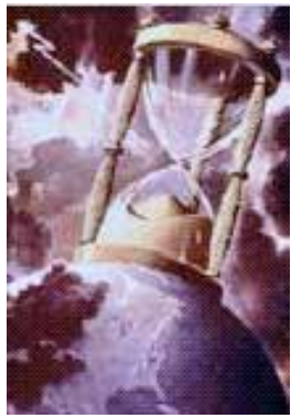
The hourglass of History is turned upside down and lets its first new grain begin to fall.

The Pharisee has been working to have a world government for himself. The anti-Christ takes advantage of this to get drunk on the power the Pharisee put in his hands. Neither of them achieves the ultimate victory.