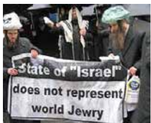
"The State of Israel does not represent all the Jews of the world."

The Jews united against Zionism states that in 1948 the State of Israel was not born by divine will as Jewish orthodoxy would like it to be, but by human will. The evidence is present in the history pages that tell of the official birth of the State of Israel. In these pages we meet the names of those who wanted the State of Israel and financed its birth. We are dealing with Jews who are extremely rich and overbearing but unfaithful to the Torah: Jews of a pharisaic nature. Their way of thinking does not coincide with that of the Jews faithful to the Torah. The pharisaic mentality does not coincide with that of the members of the Jews united against Zionism . The qualification of Zionists is applied to the former, to the latter that of non-Zionists. Sometimes it happens that the two parties confront each other in public in an acerbate but non-violent way.