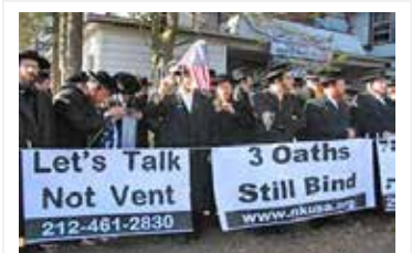
"Let's discuss it without getting upset" "The three promises we made still stand."

Concerning the Palestinians, Jews loyal to the Torah say: «Palestinians are victims of Zionist brutality and arrogance. They are victims of a kind of Zionist narcissism that sees nothing and no one but themselves. We affirm that the Palestinian people have a right to their homeland and to financial compensation for the damages and losses suffered. Palestinian refugees must be allowed to return as soon as possible to their homeland, historic Palestine. »