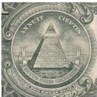
Today's Pharisees think of themselves as the eye of the pyramid which in this picture represents the "World Government."

To Proclaim themselves masters of the Earth by exploiting the biblical concept of the Kingship of Israel.