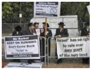
"The State of Israel has no right to govern even a piece of the Holy Land."

In the year 70 D.C., at the beginning of the third exile, the leaders of the Jewish people allegedly took a threefold oath before God, recognizable in the following three acts: