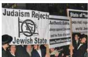
Judaism rejects the Jewish state." "Authentic Rabbis have always opposed Zionism and the State of Israel." "The State of Israel does not represent all the Jews in the world."

The five photographs collected in this section show what the mass media do not want to show: the numerous Jews who form the Jews united against Zionism association and their signs. These placards denounce the Zionists, their bad faith, and the grave injustices they perpetrate against the Palestinians.